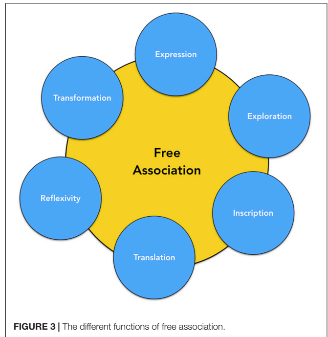
FIGURE 3 | The different functions of free association.

During psychoanalytic and psychodynamic therapies, the patient passes from one idea to another and deploys a signifying chain composed of affects and representations using both verbal and non-verbal forms of expression. This free association process is an essential component of psychoanalytic practices and relies on complementary functions as illustrated in Figure 3 . First, free association lets the subject express its intrapsychic world through increased focus on the internal experience and decreased focus on the environment. It allows for the exploration of intrapsychic reality – as a virtual reality generator (Hopkins, 2016) – by both the patient and the therapist, for the latter is also in a specific state of mental free association. Akin to dreams, free association also allows for the emergence of latent contents related to significant and mysterious elements of the subject’s psychic life. In this sense, it permits one to recognize the traces of traumatic experiences having induced “permanent disturbances of the manner in which the energy operates” (Holmes and Nolte, 2019, p. 6) as well as the traces